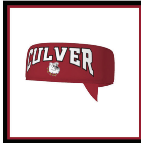
CULVER HEADBAND $10.00 One Size Fits All