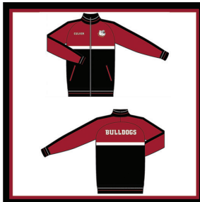
TRACK JACKET $50.00 Youth: S - M - L - XL Adult: S - M - L - XL