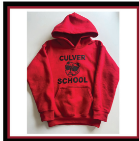
BULLDOG HOODIE $20.00 Youth: XS - S - M - L - XL Adult: S - M - L - XL