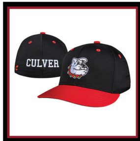
CULVER BLACK FITTED HAT $18.00 XS/S - S/M - L/XL