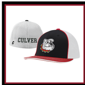
CULVER WHITE FITTED HAT $18.00 XS/S - S/M - L/XL