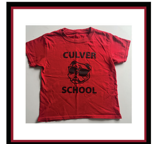
BULLDOG T-SHIRT $5.00 Youth: XS - S - M - L - XL