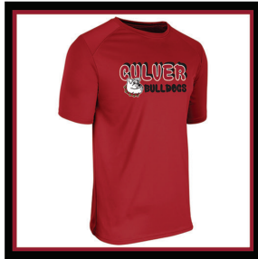
C. BULLDOGS RED T-SHIRT $12.00 Youth: S - M - L - XL Adult: S - M - L - XL

To purchase spirit wear visit https://culverschoolpta.memberhub.com/store