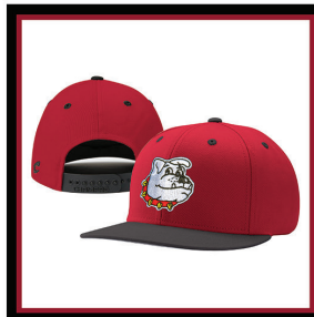
CULVER RED SNAPBACK HAT $12.00 S - M/L