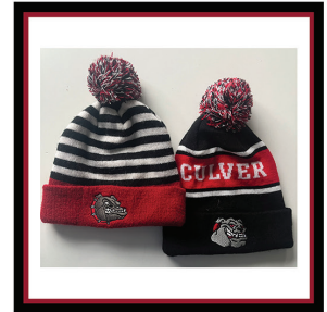
CULVER BEANIE HAT $10.00 One Size Fits All