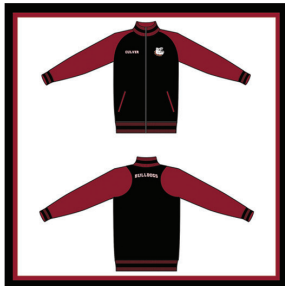
WOMEN'S TRACK JACKET A - $50.00 Adult: XS - S - M - L - XL