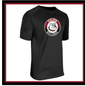
C. BULLDOGS BLACK T-SHIRT $12.00 Youth: S - M - L - XL Adult: S - M - L - XL